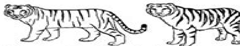
All tigers have stripes but there is variation in the stripes between each tiger.

A species is a group of organisms that are able to reproduce to give offspring that are also able to reproduce. Members of the same species have very similar characteristics (features). However, there is variation in these characteristics.