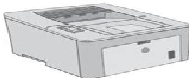
M203d M203dn M203dw