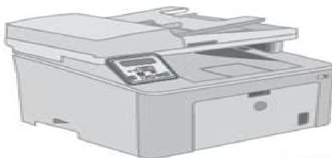
M227d M227sdn M227fdn