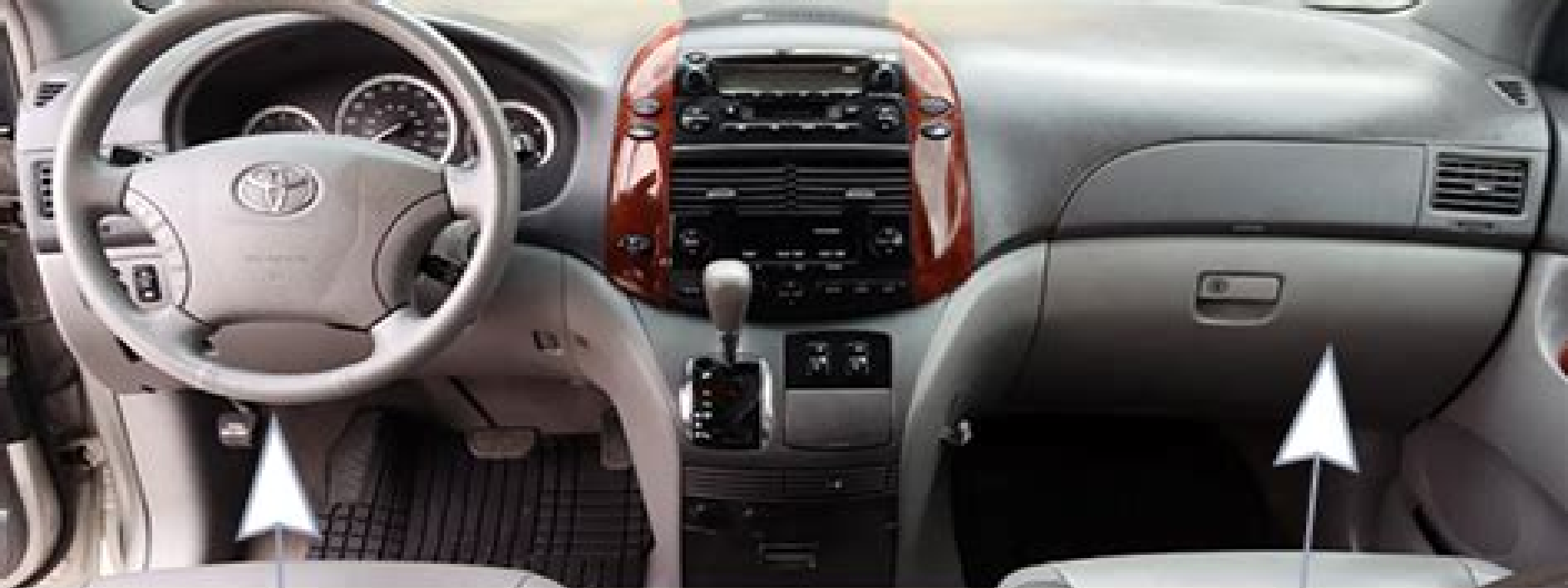
Fuse Box #1