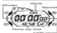
Alarm city time 1:00.00 second

The stopwatch lets you measure elapsed time, split times, and lap times. • The display range of the stopwatch is 23 hours, 59 minutes, 59.99 seconds. • The stopwatch continues to run, restarting from zero after it reaches its limit, until you stop it. • Exiting the Stopwatch Mode while a split time is frozen on the display clears the split time and returns to elapsed time measurement. • The stopwatch measurement operation continues even if you exit the Stopwatch Mode. • All of the operations in this section are performed in the Stopwatch Mode, which you enter by pressing (2).