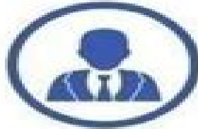
YOUR OWN BUSINESS