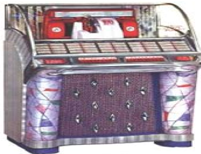
Modell 100W 1953-54

DEUTSCHE Seebücg GENERALVERTRETUNG LÖWEN-AUTOMATEN BINGEN (RHEIN) EXPORT - AUTOMATENGROSSHANDEL - IMPORT