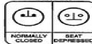
ATTACHMENT DRIVE SWITCH