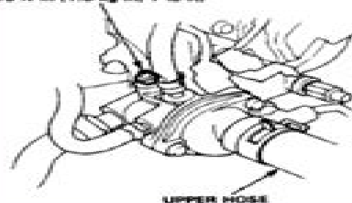
BLEED BOLT 10 N·m (1.0 kg-m, 7 lb-ft)