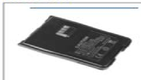
Li-Ion Spare Battery