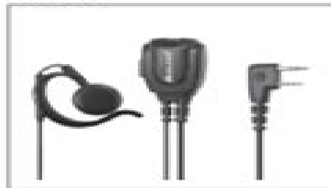
Over the Ear Headset