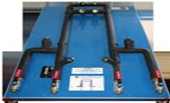
Figure 2.1: Concentric tube heat exchanger