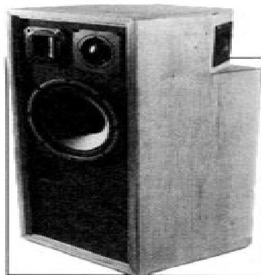
FIGURE 1: Beauty shot of finished speaker.

enclosure specifications were supplied by the retailer (McCoy Radio & Electronics), which I found very useful and fit closely with Bullock and White's BOXRESPONSE program. 2,3