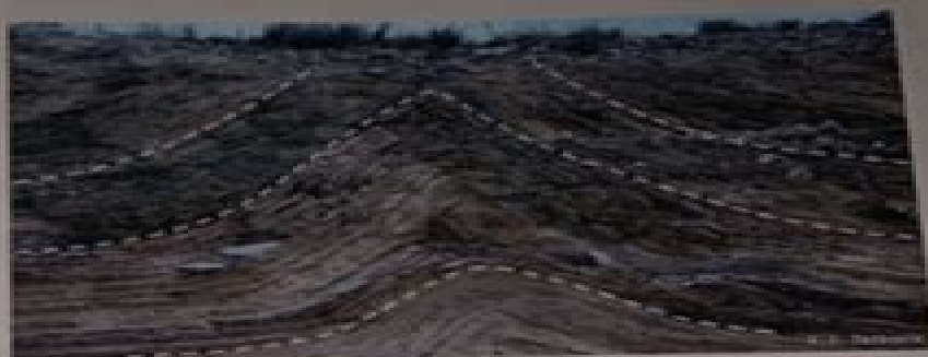
▲ Figure 6.24 Photograph to accompany Question 4.