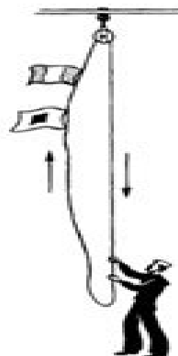
Figure 2-2.—A flag hoist.

can use it. If you lash a single block to a fixed object—an overhead, a yardarm, or a bulkhead—you give yourself the advantage of being able to pull from a convenient direction. For example, in figure 2-2 you haul up a flag hoist, but you really pull down. You can do this by having a single sheaved block made fast to the yardarm. This makes it possible for you to stand in a convenient place near the flag bag and do the job. Otherwise you would have to go aloft, dragging the flag hoist behind you.