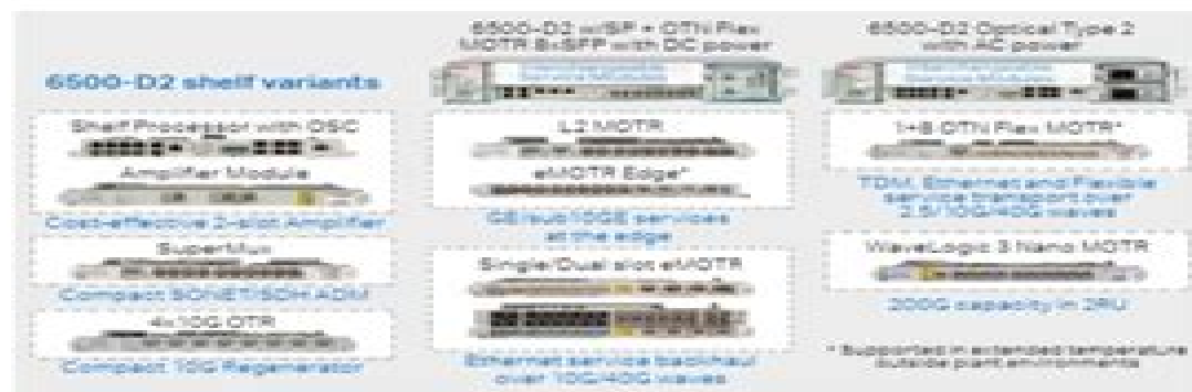
Figure 1. 6500-D2 Flexible configurations for various small office applications.

The 6500-D2 is a 2RU chassis composed of two service card-carrying slots enabling customized configurations for the strictest connectivity requirements at the access edge. The 6500-D2 offers AC and DC powering options, providing flexibility to meet customer premises power requirements, as well as backplane connectivity between the service card slots offering increased scalability and service resiliency options. Additionally, its small footprint and light weight enable field installation by a single person at locations with limited real estate.