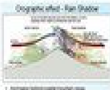
Diagram showing the Earth's orbit around the Sun and the resulting seasons.