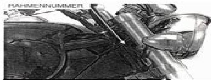
RAHMENNUMMER Die Rahmennummer ist links am Lenkkopf eingepreßt.