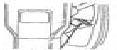
VEHICLE IDENTIFICATION NUMBER (VIN)

The engine serial number is stamped on the rear right side of the engine case.