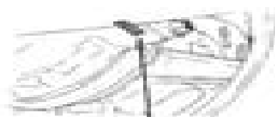
FINAL DRIVE SERIAL NUMBER

The Vehicle Identification Number (VIN) is located on the right side of the frame near the steering head on the Safety Certification Label.