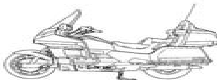
ENGINE SERIAL NUMBER

The engine serial number is stamped on the rear right side of the engine case.