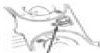
CARBURETOR IDENTIFICATION NUMBER

The frame serial number is stamped on the right side of the steering head.