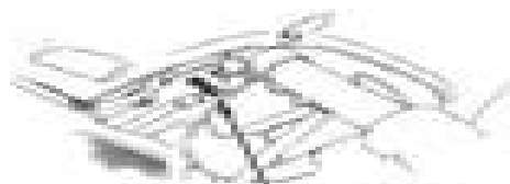
FRAME SERIAL NUMBER

The engine serial number is stamped on the rear right side of the engine case.