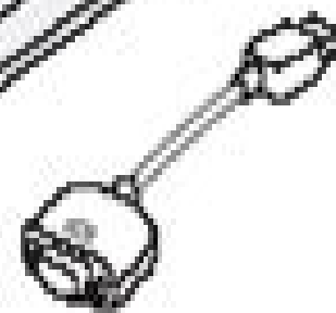
Micro-DVI to VGA Adapter