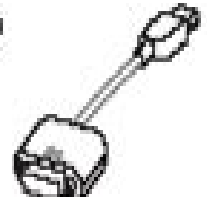
Micro-DVI to DVI Adapter