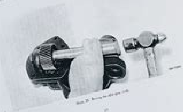
1992, 1993, 1994, 1995, 1996, 1997, 1998, 1999, 2000, 2001, 2002, 2003, 2004, 2005, 2006, 2007, 2008, 2009, 2010, 2011, 2012, 2013, 2014, 2015, 2016, 2017, 2018, 2019, 2020, 2021, 2022, 2023, 2024, 2025, 2026, 2027, 2028, 2029, 2030, 2031, 2032, 2033, 2034, 2035, 2036, 2037, 2038, 2039, 2040, 2041, 2042, 2043, 2044, 2045, 2046, 2047, 2048, 2049, 2050, 2051, 2052, 2053, 2054, 2055, 2056, 2057, 2058, 2059, 2060, 2061, 2062, 2063, 2064, 2065, 2066, 2067, 2068, 2069, 2070, 2071, 2072, 2073, 2074, 2075, 2076, 2077, 2078, 2079, 2080, 2081, 2082, 2083, 2084, 2085, 2086, 2087, 2088, 2089, 2090, 2091, 2092, 2093, 2094, 2095, 2096, 2097, 2098, 2099, 2100, 2101, 2102, 2103, 2104, 2105, 2106, 2107, 2108, 2109, 2110, 2111, 2112, 2113, 2114, 2115, 2116, 2117, 2118, 2119, 2120, 2121, 2122, 2123, 2124, 2125, 2126, 2127, 2128, 2129, 2130, 2131, 2132, 2133, 2134, 2135, 2136, 2137, 2138, 2139, 2140, 2141, 2142, 2143, 2144, 2145, 2146, 2147, 2148, 2149, 2150, 2151, 2152, 2153, 2154, 2155, 2156, 2157, 2158, 2159, 2160, 2161, 2162, 2163, 2164, 2165, 2166, 2167, 2168, 2169, 2170, 2171, 2172, 2173, 2174, 2175, 2176, 2177, 2178, 2179, 2180, 2181, 2182, 2183, 2184, 2185, 2186, 2187, 2188, 2189, 2190, 2191, 2192, 2193, 2194, 2195, 2196, 2197, 2198, 2199, 2200, 2201, 2202, 2203, 2204, 2205, 2206, 2207, 2208, 2209, 2210, 2211, 2212, 2213, 2214, 2215, 2216, 2217, 2218, 2219, 2220, 2221, 2222, 2223, 2224, 2225, 2226, 2227, 2228, 2229, 2230, 2231, 2232, 2233, 2234, 2235, 2236, 2237, 2238, 2239, 2240, 2241, 2242, 2243, 2244, 2245, 2246, 2247, 2248, 2249, 2250, 2251, 2252, 2253, 2254, 2255, 2256, 2257, 2258, 2259, 2260, 2261, 2262, 2263, 2264, 2265, 2266, 2267, 2268, 2269, 2270, 2271, 2272, 2273, 2274, 2275, 2276, 2277, 2278, 2279, 2280, 2281, 2282, 2283, 2284, 2285, 2286, 2287, 2288, 2289, 2290, 2291, 2292, 2293, 2294, 2295, 2296, 2297, 2298, 2299, 2300, 2301, 2302, 2303, 2304, 2305, 2306, 2307, 2308, 2309, 2310, 2311, 2312, 2313, 2314, 2315, 2316, 2317, 2318, 2319, 2320, 2321, 2322, 2323, 2324, 2325, 2326, 2327, 2328, 2329, 2330, 2331, 2332, 2333, 2334, 2335, 2336, 2337, 2338, 2339, 2340, 2341, 2342, 2343, 2344, 2345, 2346, 2347, 2348, 2349, 2350, 2351, 2352, 2353, 2354, 2355, 2356, 2357, 2358, 2359, 2360, 2361, 2362, 2363, 2364, 2365, 2366, 2367, 2368, 2369, 2370, 2371, 2372, 2373, 2374, 2375, 2376, 2377, 2378, 2379, 2380, 2381, 2382, 2383, 2384, 2385, 2386, 2387, 2388, 2389, 2390, 2391, 2392, 2393, 2394, 2395, 2396, 2397, 2398, 2399, 2400, 2401, 2402, 2403, 2404, 2405, 2406, 2407, 2408, 2409, 2410, 2411, 2412, 2413, 2414, 2415, 2416, 2417, 2418, 2419, 2420, 2421, 2422, 2423, 2424, 2425, 2426, 2427, 2428, 2429, 2430, 2431, 2432, 2433, 2434, 2435, 2436, 2437, 2438, 2439, 2440, 2441, 2442, 2443, 2444, 2445, 2446, 2447, 2448, 2449, 2450, 2451, 2452, 2453, 2454, 2455, 2456, 2457, 2458, 2459, 2460, 2461, 2462, 2463, 2464, 2465, 2466, 2467, 2468, 2469, 2470, 2471, 2472, 2473, 2474, 2475, 2476, 2477, 2478, 2479, 2480, 2481, 2482, 2483, 2484, 2485, 2486, 2487, 2488, 2489, 2490, 2491, 2492, 2493, 2494, 2495, 2496, 2497, 2498, 2499, 2500, 2501, 2502, 2503, 2504, 2505, 2506, 2507, 2508, 2509, 2510, 2511, 2512, 2513, 2514, 2515, 2516, 2517, 2518, 2519, 2520, 2521, 2522, 2523, 2524, 2525, 2526, 2527, 2528, 2529, 2530, 2531, 2532, 2533, 2534, 2535, 2536, 2537, 2538, 2539, 2540, 2541, 2542, 2543, 2544, 2545, 2546, 2547, 2548, 2549, 2550, 2551, 2552, 2553, 2554, 2555, 2556, 2557, 2558, 2559, 2560, 2561, 2562, 2563, 2564, 2565, 2566, 2567, 2568, 2569, 2570, 2571, 2572, 2573, 2574, 2575, 2576, 2577, 2578, 2579, 2580, 2581, 2582, 2583, 2584, 2585, 2586, 2587, 2588, 2589, 2590, 2591, 2592, 2593, 2594, 2595, 2596, 2597, 2598, 2599, 2600, 2601, 2602, 2603, 2604, 2605, 2606, 2607, 2608, 2609, 2610, 2611, 2612, 2613, 2614, 2615, 2616, 2617, 2618, 2619, 2620, 2621, 2622, 2623, 2624, 2625, 2626, 2627, 2628, 2629, 2630, 2631, 2632, 2633, 2634, 2635, 2636, 2637, 2638, 2639, 2640, 2641, 2642, 2643, 2644, 2645, 2646, 2647, 2648, 2649, 2650, 2651, 2652, 2653, 2654, 2655, 2656, 2657, 2658, 2659, 2660, 2661, 2662, 2663, 2664, 2665, 2666, 2667, 2668, 2669, 2670, 2671, 2672, 2673, 26

WARNING: The safety instructions are listed on the front panel. Read the safety instructions before using the product. Do not use the product if the safety instructions are not followed. Do not use the product if the safety instructions are not followed.